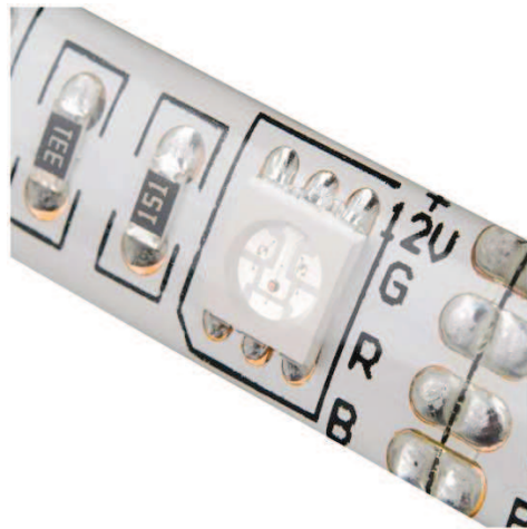
Figure 5: RGB LED strip element

The design on the system was based on these functional concepts: