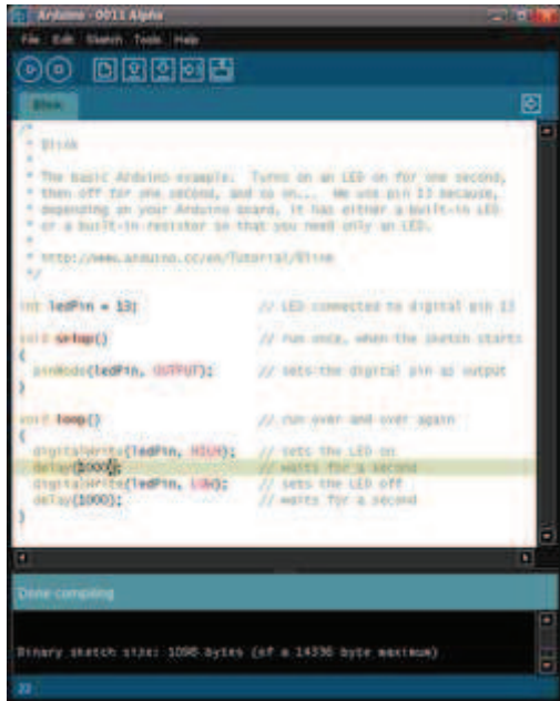
Figure 1: The Arduino IDE

An example of the Arduino IDE is shown on Fig.1