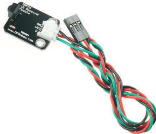
Figure 3: IR Receiver